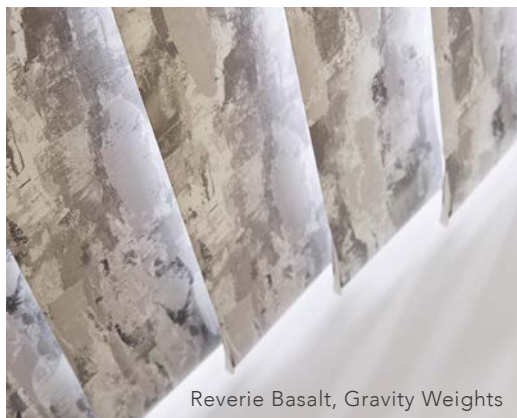
Reverie Basalt, Gravity Weights

For a contemporary aesthetic there's the option of 'sewn in' weights and 'gravity weights', removing the need for chain and finishing off your blind perfectly.