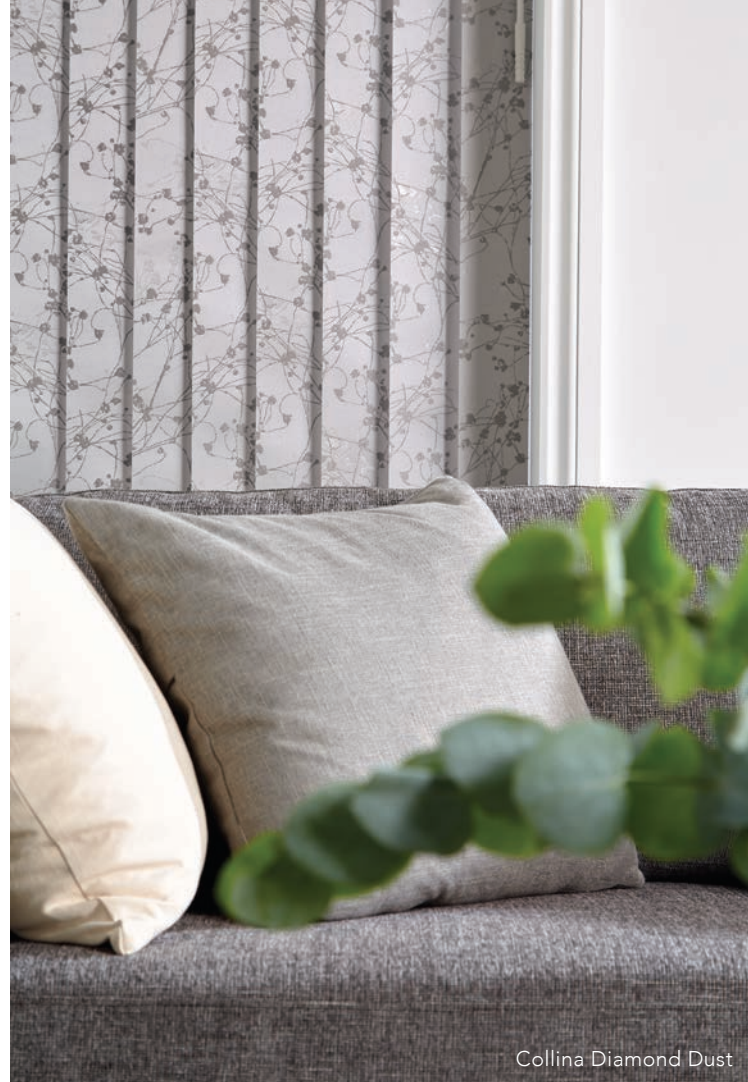
Collina Diamond Dust