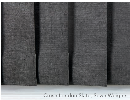
Crush London Slate, Sewn Weights