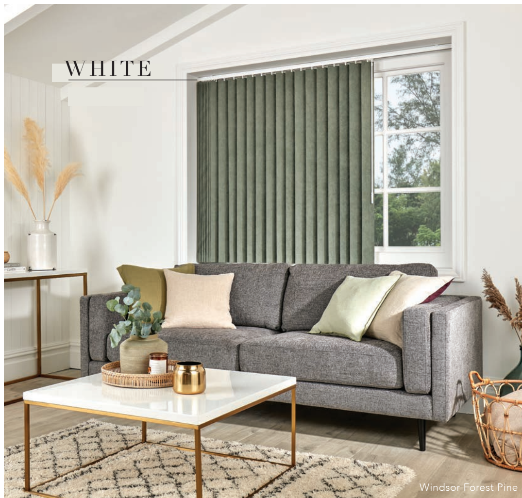
Windsor Forest Pine