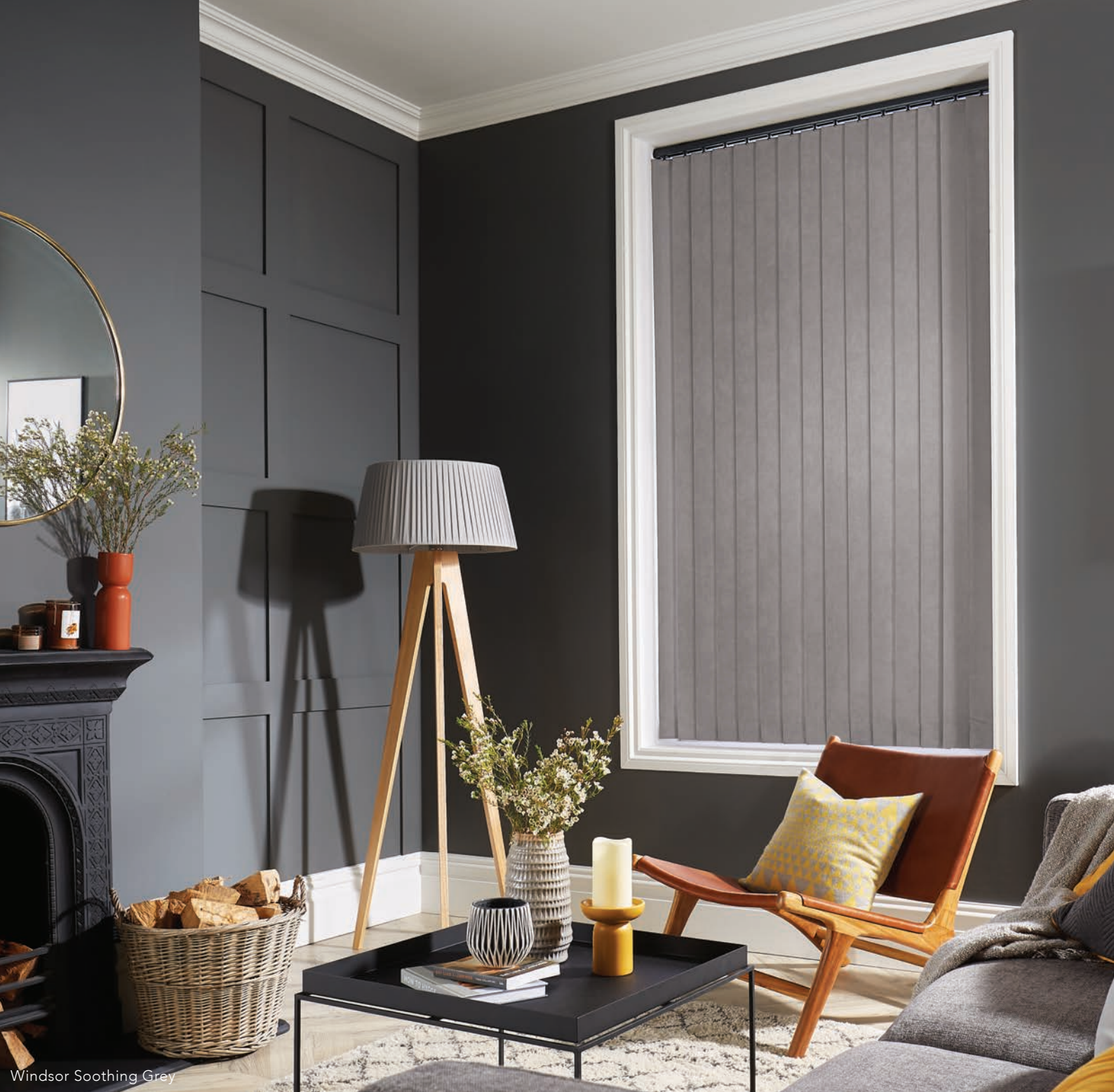
Windsor Soothing Grey

View the full collection by visiting your local stockist or our website, where you can order complimentary fabric samples.